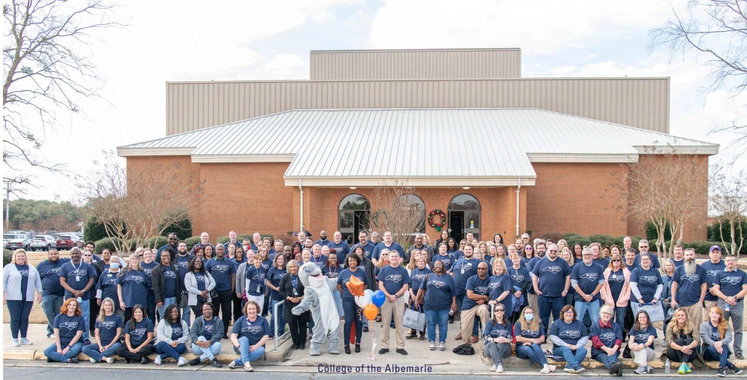
College of the Albemarle